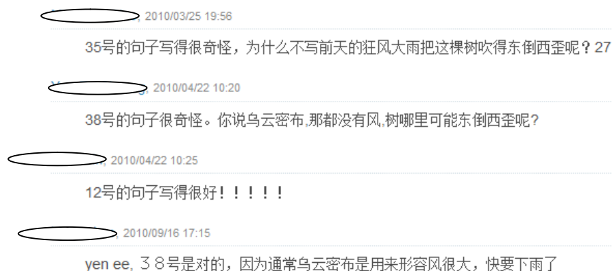
Figure 8. A screenshot excerpt of “东倒西歪” (“Tilted; at sixes and sevens”) comment space.

Yes, Orchard Road is certainly very crowded during Christmas.