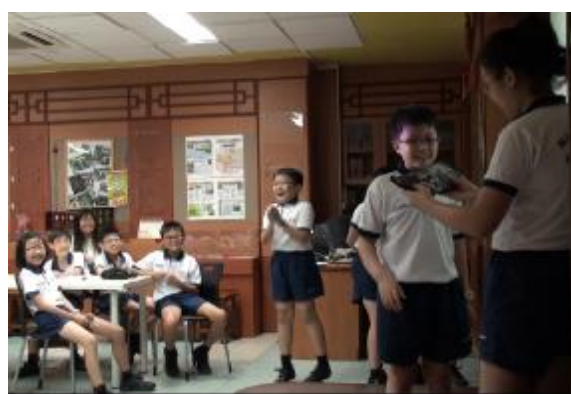
Figure 3. Group performance.