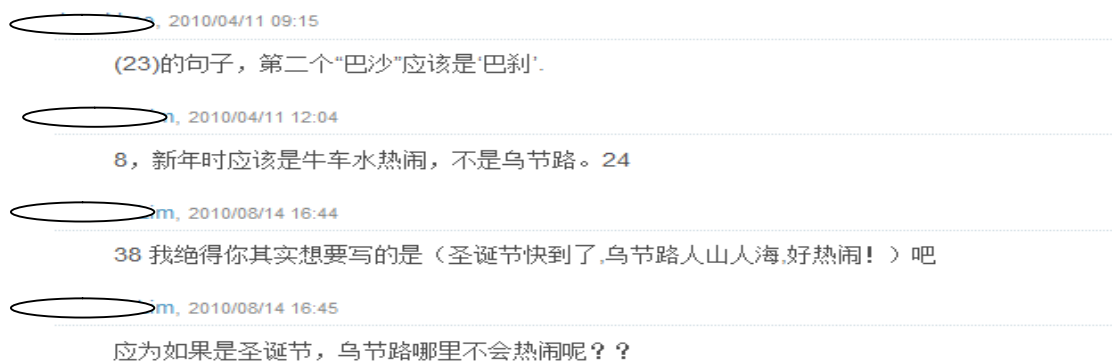
Figure 7. A screenshot excerpt of “人山人海” (“a sea of faces”) comment space.

Figures 7 and 8 depict excerpts of the peer discussions on two different idiom pages.