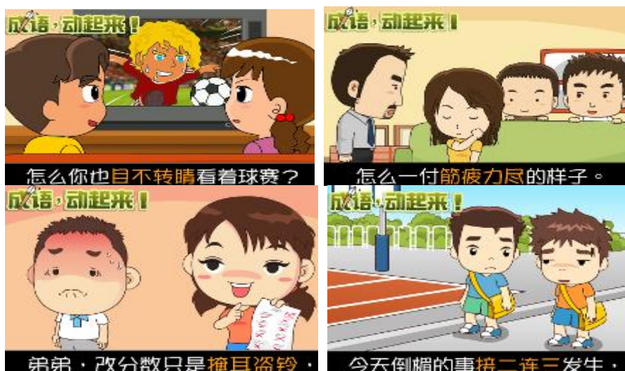
Figure 4. Screenshots of idiomatic animations.