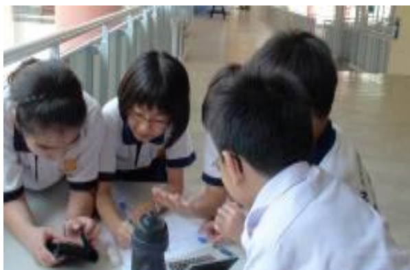
Figure 2. Group discussion.